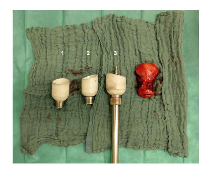
Fig. 1 Different portio caps used for total laparoscopic hysterectomy ((1)–32 mm, (2)–35 mm, and (3)–40 mm)

This study has several limitations. It was retrospective and may have involved reporting bias. However, patient identification from a prospectively maintained service database, and