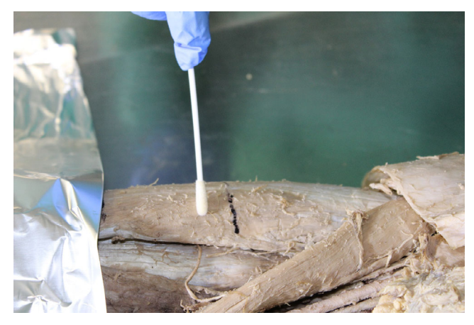
Fig. 2. Two areas of skeletal muscle comparable in size were labeled and one was covered using aluminum foil. Swabs were taken from both areas after UV-C irradiation. [Color figure can be viewed at wileyonlinelibrary.com]

After exposition, the areas were probed with a fresh eSwab tip, prewetted with Amies transport medium,