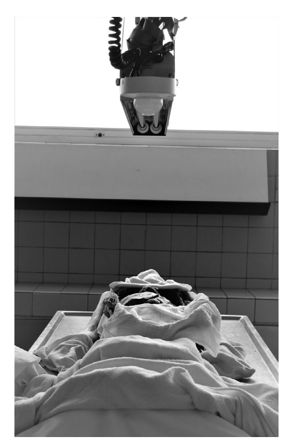
Fig. 1. An ultraviolet lamp mounted above a dissection table. Also visible is the motion detector that prevents irradiation of any person nearby.